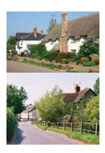
Back to top