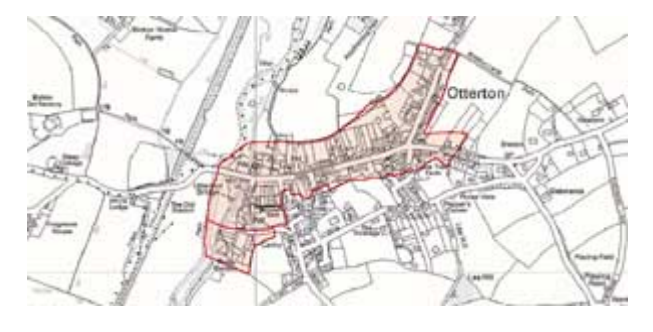
A current map of Otterton depicting the conservation area boundary: