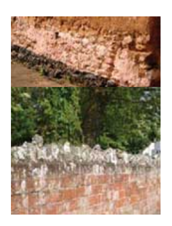
Back to top

Finally, the use of stone, brick and flint, or perhaps a traditional bank for boundaries should be promoted, while the art of cob construction also still exists.